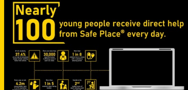
Slide eight: Value proposition