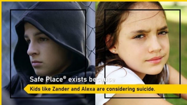
Slide seven: The problem (suicide)